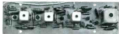
old IF strip

Used in the vital FM tuner IF strip, Scott Integrated Circuits actually incorporate more circuitry in less space. The new Scott IF strip now contains 20 transistors, as compared to four in the previous model. Scott's previous IF strip, without IC's, gave superb