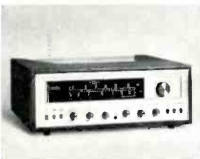
Scott 380 AM/FM Tuner/Amplifier has all of the features and fine performance characteristics of the 340B. It includes, in addition, superb Scott Wide-Range AM... the AM circuit Hirsch-Houck Labs called "the finest AM tuner we know of on the current market." $469.95

"... Suffice it to say that the unit met, and in many cases substantially exceeded, every one of the ratings for which we were able to test. It is not often that we can confirm EVERY published specification of a high fidelity component, particularly one as complex as (this), and it was a gratifying and pleasant experience . . ." $399.95