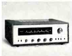
Scott 345 FM Stereo Tuner/Amplifier. The moderately-priced 64-watt 345 features Time-Switching multiplex circuitry, famous silver plated RF front end with 2.2 \mu v IHF usable sensitivity, and most of the other high quality features of the 340B. Automatic indicator light tells you when to switch to stereo. Like all Scott components, the 345 carries a full two-year guarantee. $364.95