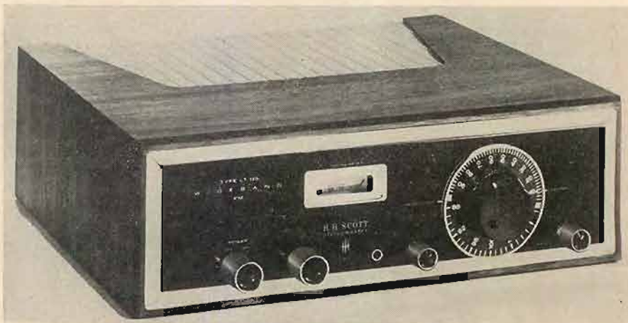
Fig. 3. H. H. Scott FM-Stereo tuner kit, Model LT-110.

The only other change, except for some obvious ones in the power supply (to accommodate the four extra tubes), is the inclusion of a switch in the a.g.c. circuit to permit the tuning meter and a.g.c. to be more sensitive for the lower signal levels normally encountered in stereo transmission. Again, in common with all of the H. H. Scott FM tuners, the LT-110 does not provide a.f.e. And, again, it didn't need it.