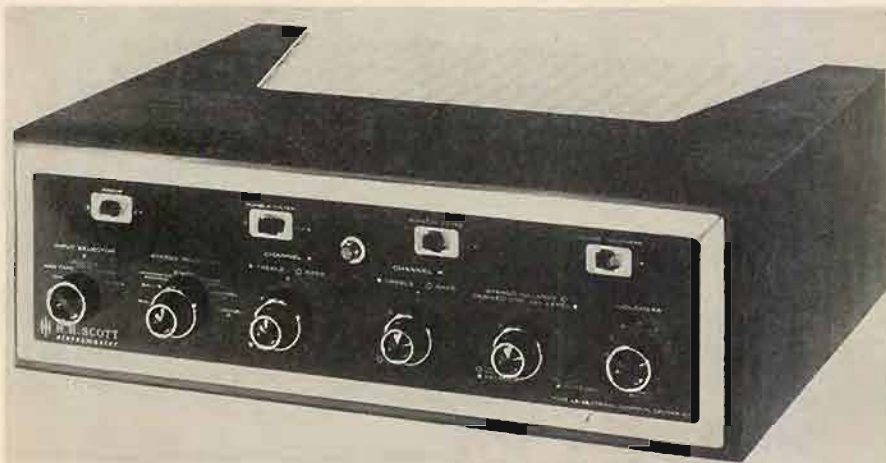
Fig. 1. H. H. Scott amplifier kit, Model LK-48.

It required eighteen hours and fifteen minutes to construct the LK-48. Approximately one hour of this time was spent getting familiar with the instruction manual and checking the parts. The use of full color in the instruction manual, plus unusually well thought out and simplified procedures, makes it so easy to build the LK-48 that the only conceivable reason for the unit not operating properly upon completion is carelessness. Even the novice kit builder can construct this unit without difficulty. The step-by-step layout of wiring and parts is on a left-to-right basis (wonder what would happen if the constructor were left-handed?). The only difficulty we experienced was the complete absence of one small wire and another wire being shorter than it was supposed to be. On the other hand, all other parts and wires were appropriate for their location and of proper size. Considering the large number of individual pieces in this kit, it is a remarkable feat of production that everything measured so beautifully. As a suggestion to the manufacturer, we felt that it would be valuable if the prices for replacement parts were included. A final suggestion (in keeping with the editorial in the February issue), we feel that it would be extremely helpful if information were included as to why certain leads must be kept