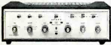
New 299D 80-Watt Stereo Amplifier

This best-selling stereo amplifier, top-rated by all leading consumer testing organizations, is now better than ever. New luxury features include: direct connection for powered center channel and extension speakers, speaker switch for private listening, new switching for choice of five low level inputs, non-magnetic electrolytic aluminum chassis, exclusive Scott Balance Left/Right level balancing system, and massive output transformers. Behind the handsome panel, with its easy-grip knobs, is a lifetime of trouble-free performance and power to spare. $229.95