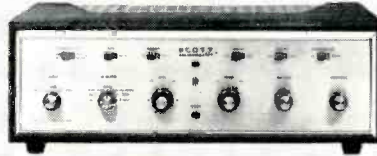
New 222D 50-Watt Stereo Amplifier

There's a new look to the ever-popular 222 series . . . and new performance, too. Massive transformers deliver enough power to drive even the most inefficient speaker systems . . . and the 222D gives you power in the low frequencies, where it's really needed. This value-packed performer incorporates a center channel speaker connection without the need for an additional amplifier, speaker switch for private listening, front panel switch for selection of phono or tape deck. Build a quality music system around this most versatile, feature-filled amplifier. $179.95