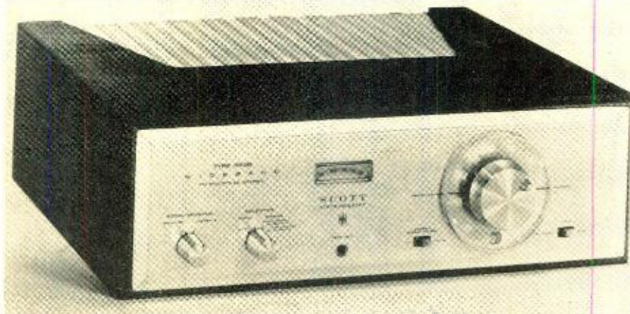
Fig. 1. H. H. Scott Model 350B FM-Stereo tuner.

With a cartridge in place, one presses the PLAY button. The operating cycle then commences with the left platform lowering the cartridge to the playing position; an idler drives the reel, pushing the leader outward until it engages with the take-up reel; notches in the leader actuate the mechanism so that when the tape is in front of the heads a guide moves and contacts